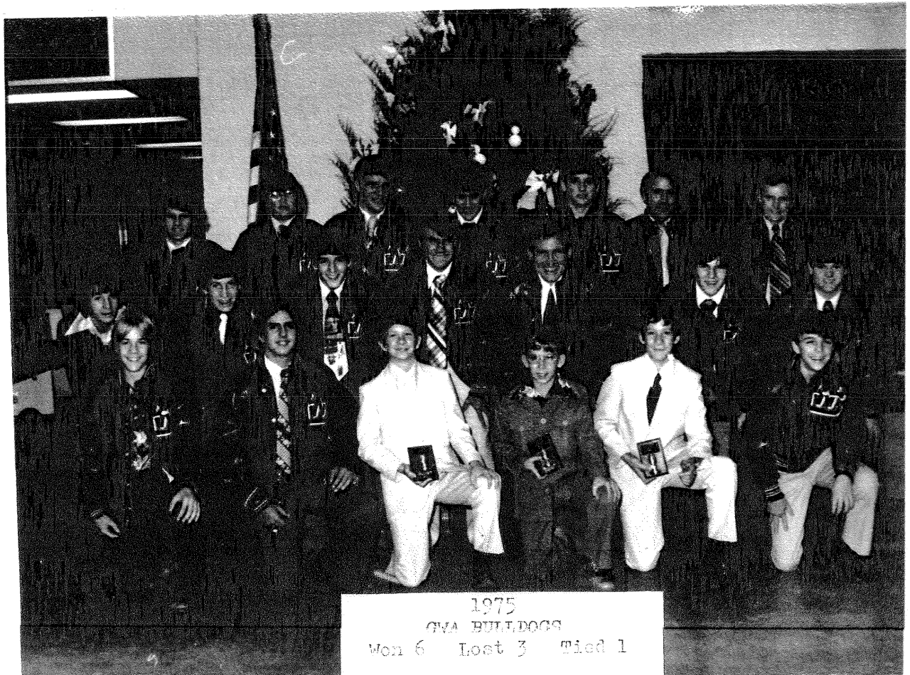
1975 GVA BULLDOGS Won 6 Lost 3 Tied 1