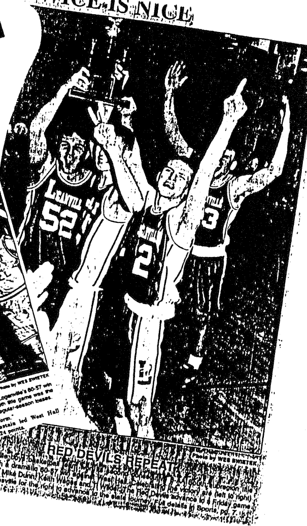
Red Devils repeat. Loganville wins 60-57 over West Hall.