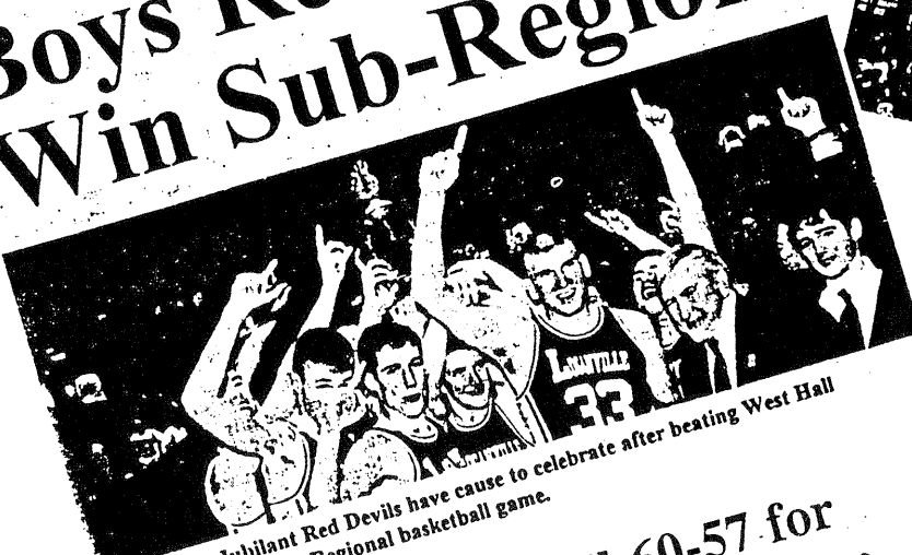
Jubilant Red Devils have cause to celebrate after beating West Hall in a Sub-Regional basketball game.