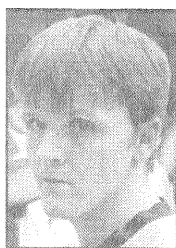
DEFENSIVE PLAYER OF THE YEAR